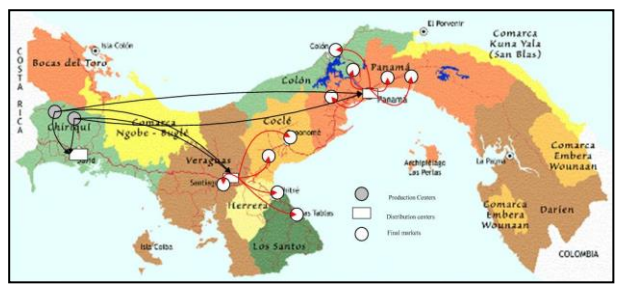
Figure 2: Distribution network for the lettuce

With the information provided, a map of the distribution network was developed. This map is shown in figure 2. As seen, two production areas were located, both in the Province of Chiriquí, 500 km west of Panama City. Lettuce is transported from these areas to different distribution points. These points are David, the largest city of Chiriquí, which distributes lettuce to the rest of the province. Also, lettuce is sent to Santiago, in the Province of Veraguas, where lettuce is sent to the province and to other areas in the middle of the country, thus it serves also as distribution centers. Finally, the products are shipped to the main distribution point in Panama City, the Supply Central Market that supplies products to the west, east, north and central areas of the Province of Panama, and also to the Province of Colon, located in the Caribbean area of Panama