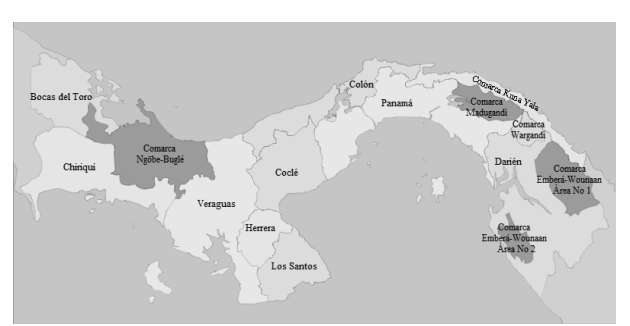
Figure 1: The geography of the Republic of Panama

methodology used and some of the main results of the project.